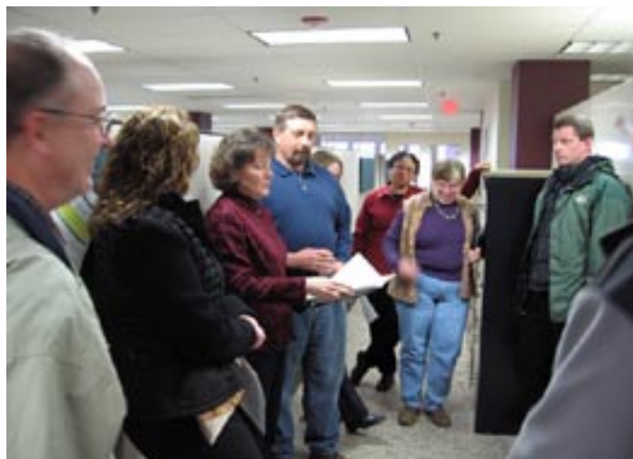
IFMAdison members enjoy their tour of GEF 2.