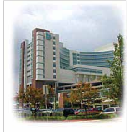
Pearson Engineering helped Aurora Health Care save over $1 million in just one year.

Better yet, we did it without expensive building modifications and equipment. We simply made data-driven suggestions on how Aurora's staff could easily modify system operations to reduce energy consumption, and worked closely with them to achieve our ambitious goals!